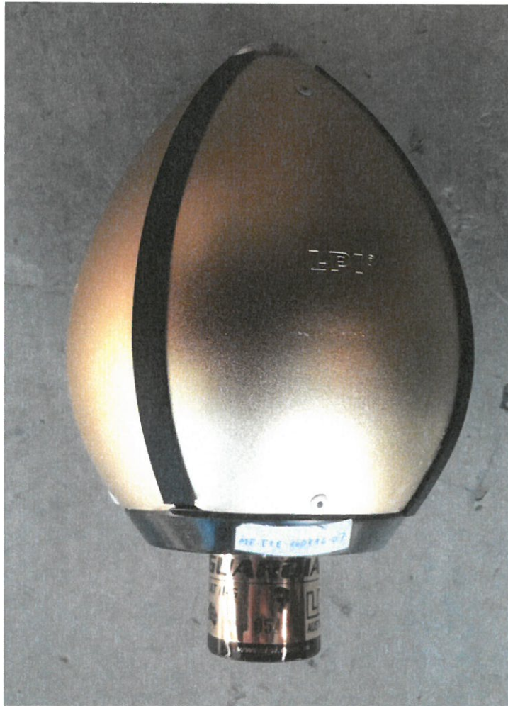
Figure 1. ME-ITE-160896/07 (GUARDIAN CAT-2-G)

INSTITUTO TECNOLÓGICO DE LA ENERGÍA (ITE) Centro Tecnológico CT nº 74