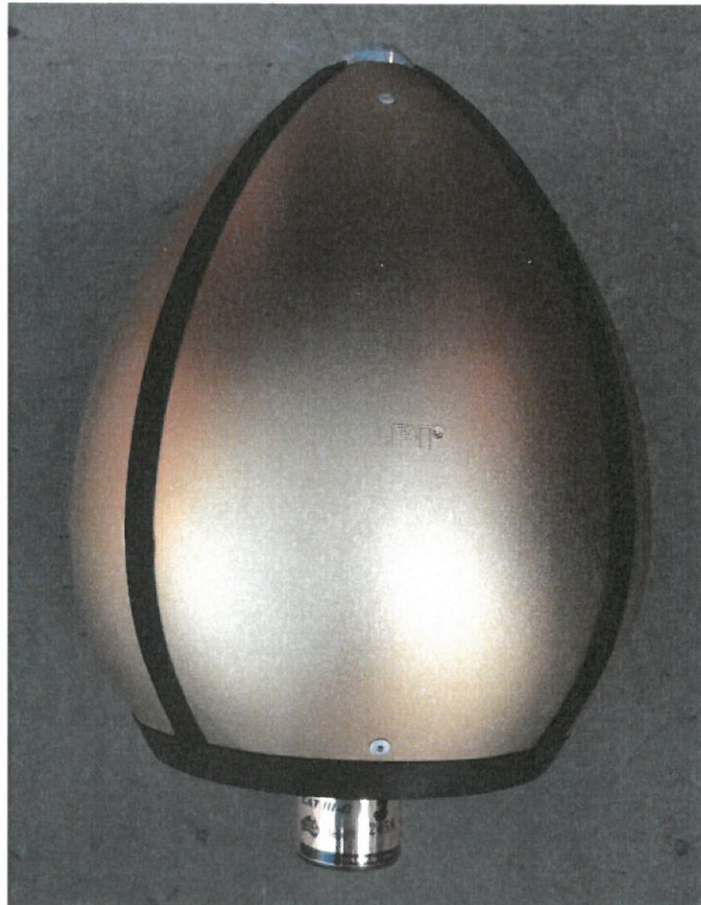
Figure 1. ME-ITE-160896/03 (GUARDIAN CAT-3-G)

INSTITUTO TECNOLÓGICO DE LA ENERGÍA (ITE) Centro Tecnológico CT nº 74