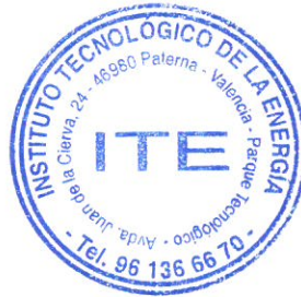
Stamp of the institution