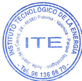
Stamp of the institution