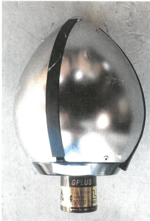
Figure 1. ME-ITE-160896/14 (GPLUS-2SS-IM)

INSTITUTO TECNOLÓGICO DE LA ENERGÍA (ITE) Centro Tecnológico CT nº 74