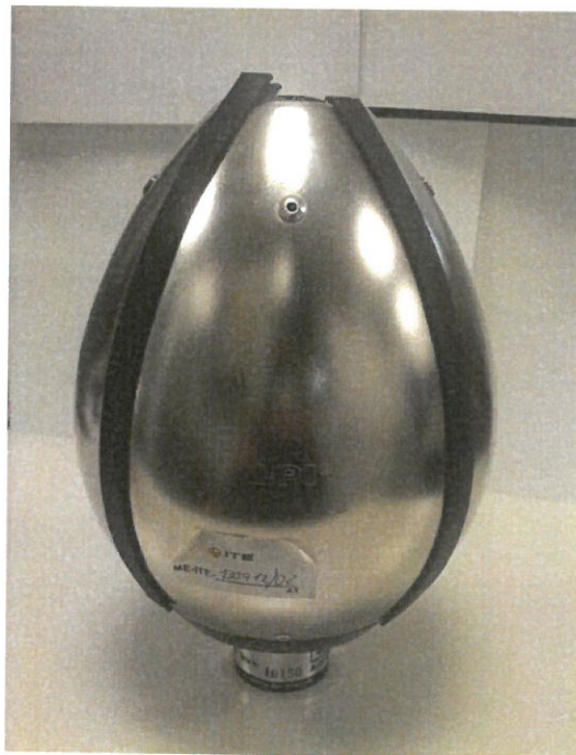
Figure 2. ME-ITE-130912/02

The ESE's marking is engraved on its body (LPI and \Delta t ) and also printed on a sticker in the lower part.