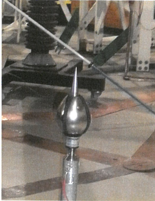
Figure 4. Early Emission Test