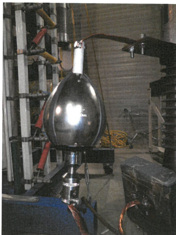
Figure 3. Electric Test.