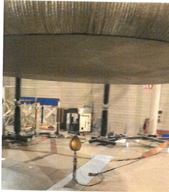
Figure 4. Early Emission Test