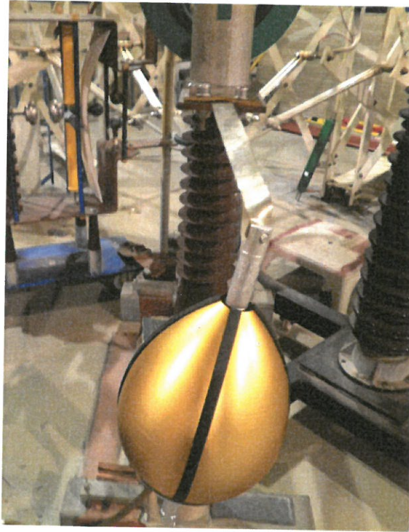
Figure 3. Electric Test.