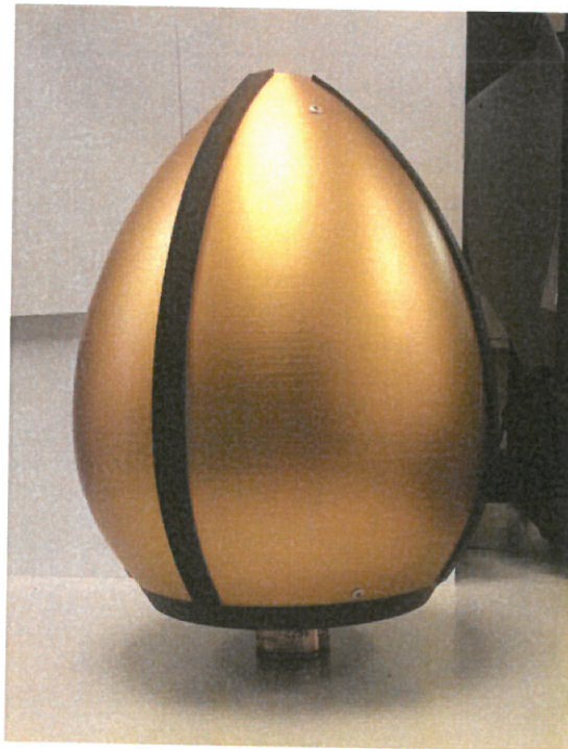
Figure 2. ME-ITE-130912/02

The ESE's marking is engraved on its body (LPI and \Delta t ) and also printed on a sticker in the lower part.