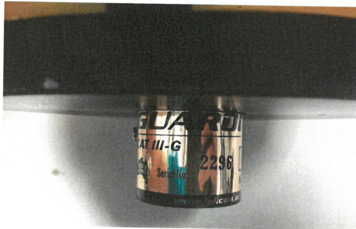
Figure 1. ESE's marking.

NOTE: The marking of the sample was in a ESE prototype, renamed after the test as "Stormaster 50"